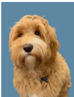
Physis the Therapy Dog

Pediatric, Fellowships, Pediatric, Spine